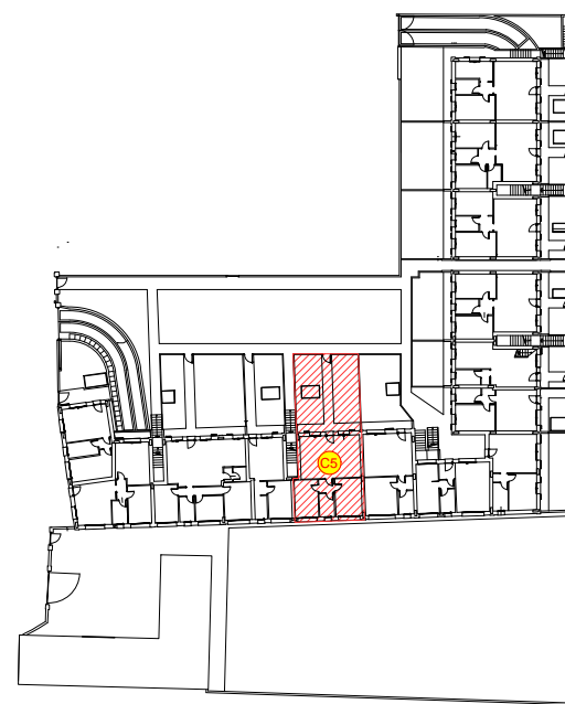
PLANIMETRIA GENERALE PIANO TERRA