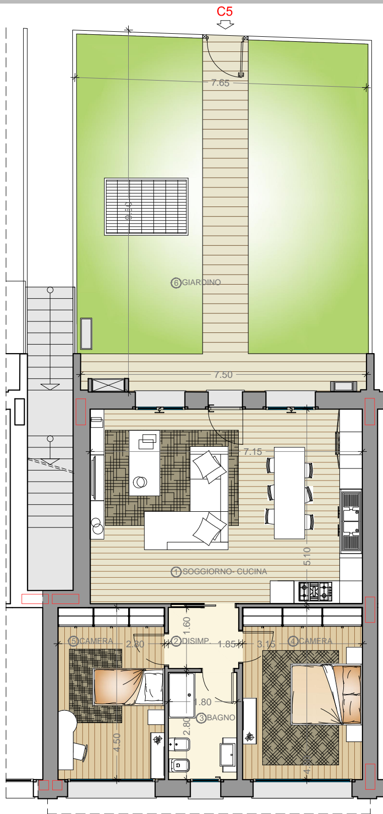
PLANIMETRIA PIANO TERRA